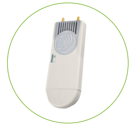
ePMP 1000 GPS Sync Radio

Using the 5 GHz frequency spectrum, the new ePMP architecture is the most effective connectivity solution for reaching the under- and unconnected around the world.