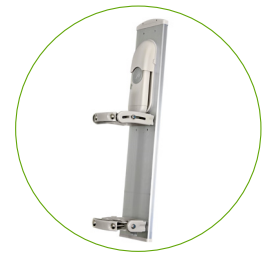
ePMP 1000 GPS Sync Radio Integrated with a Sector Antenna