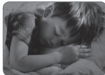
See up to 5m in the dark