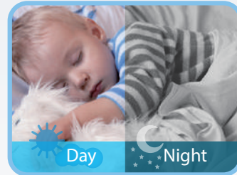
Day & night vision