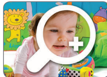
Digital zoom up to 4x from your mobile device