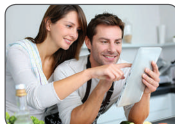
Check in on your baby using your smartphone or tablet