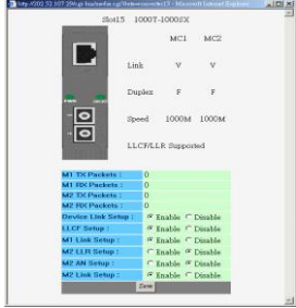
NOTE: To control the function in a working station, need to collocate together with optional Chassis System and Management Module.