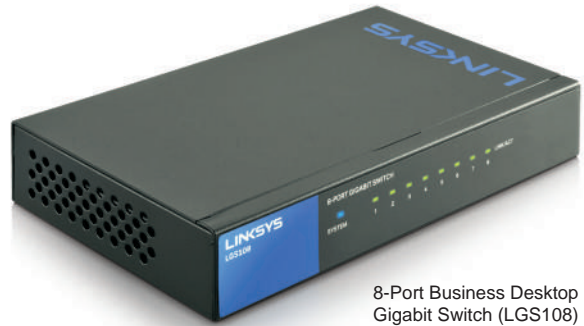
8-Port Business Desktop Gigabit Switch (LGS108)