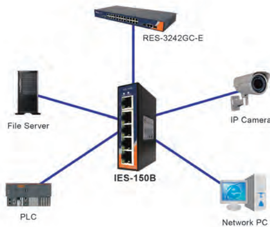
Connections of Ethernet devices

IES-150B can be used in connecting several Ethernet devices like Ethernet I/O, IP-Camera or other Ethernet switches. In addition, its mini size enables easily installation and minimize space requirement.