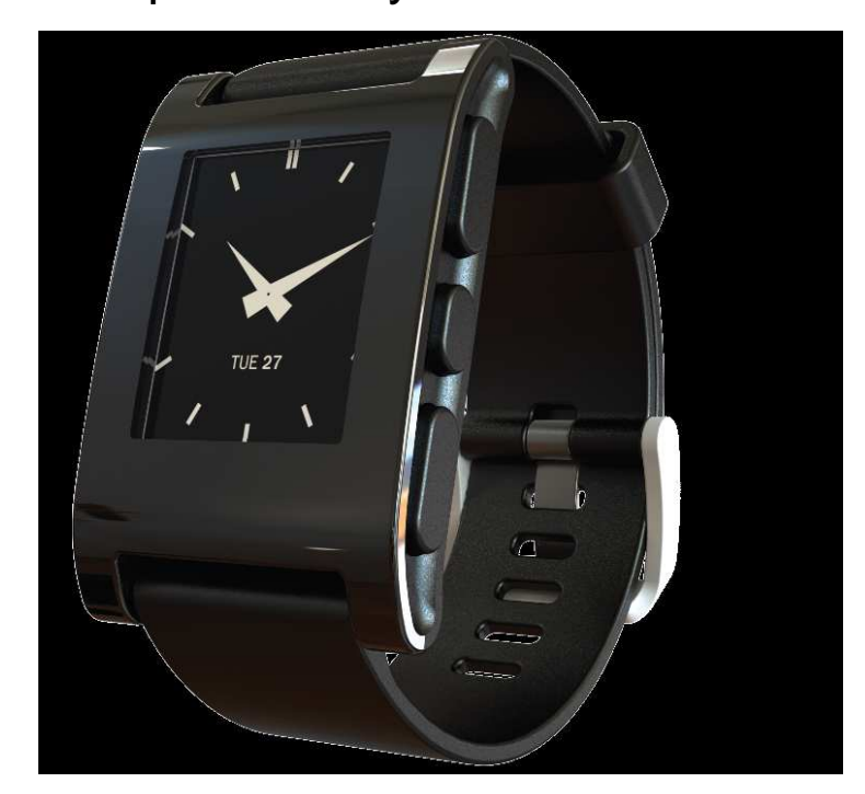
ID for reference only